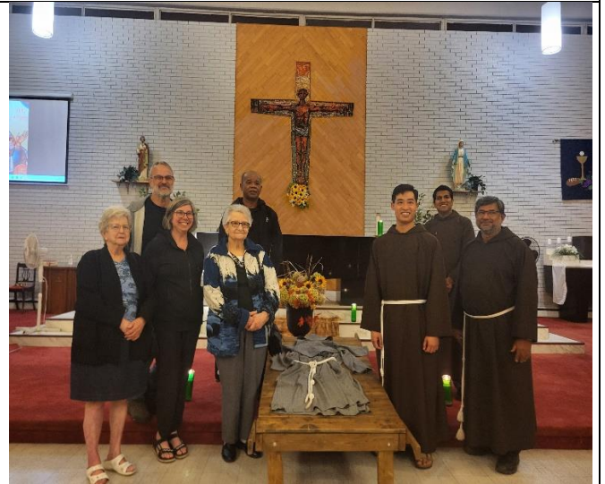
St. François d'Assise Frat., Ottawa, Transitus