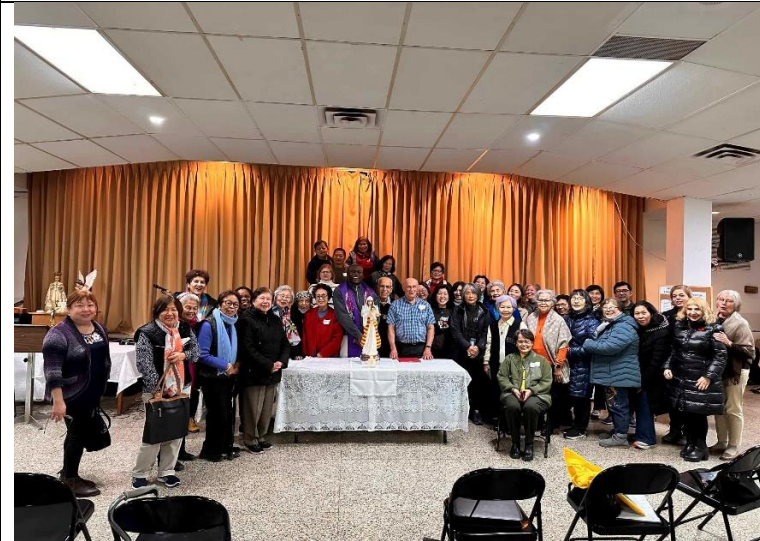
Annual Day of Recollection in Montreal area, Nov.'24