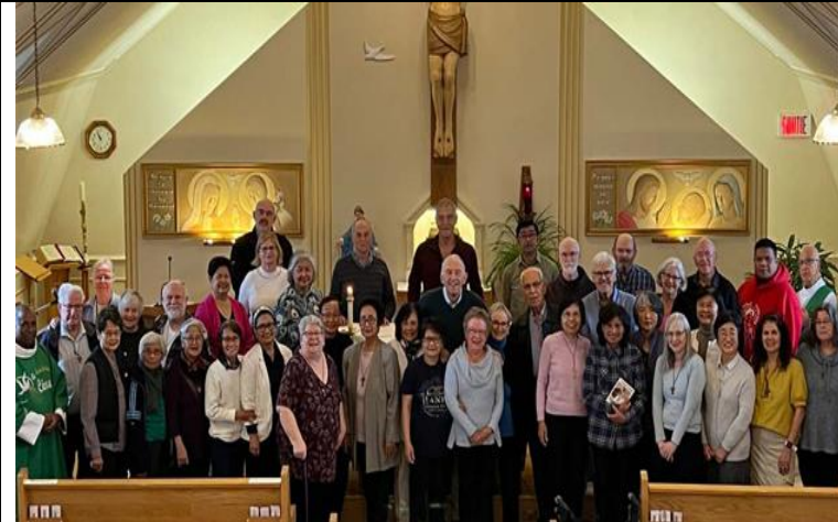
Eastern Reg. Leadership Development Workshop Oct.'24