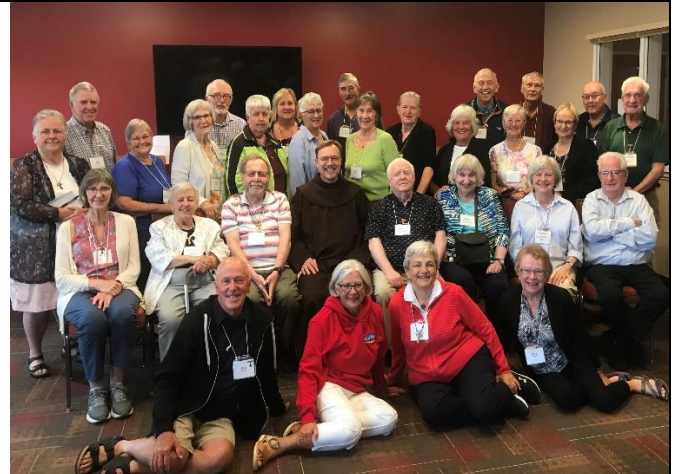
St. Francis of Assisi Fraternity Retreat Sept. '24