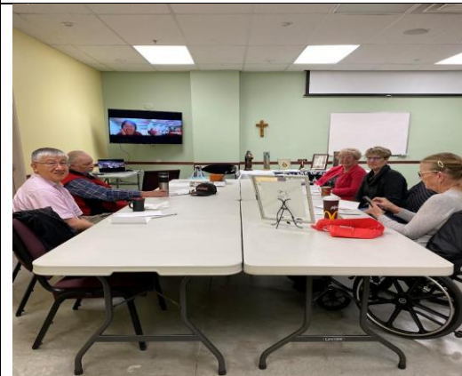
The 800 th Centenary of the Feast of the Stigmata of St. Francis of Assisi, St. Clare Fraternity, Coquitlam, BC