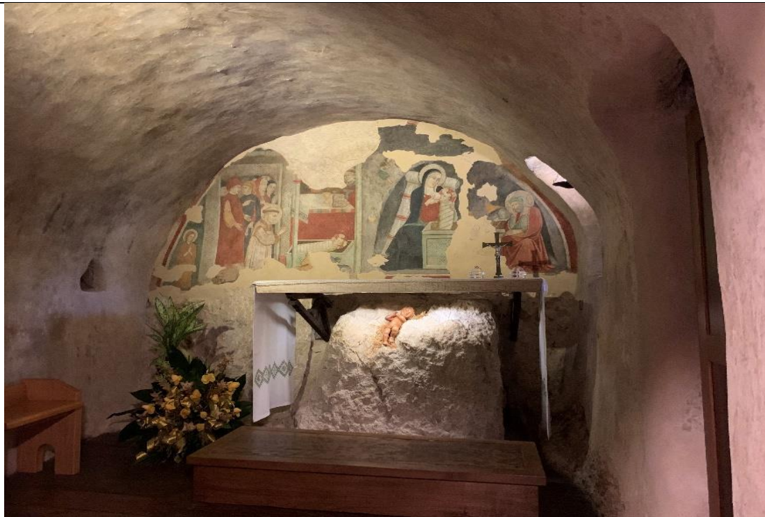
at Greccio, Italy